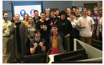
4Front Credit Union comes to PHS