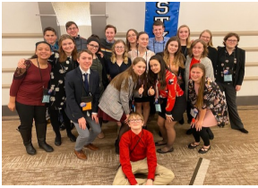
Petoskey students participate in Michigan Youth in Government